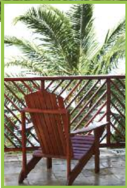
View from Calibishie Cove

Sitting on your ocean front balcony at Calibishie Cove , with the wind blowing in your face is the essence of relaxation. I felt my mind physically let go of a mountain of thought and for the first time in weeks I began to unwind. Hazel the caretaker was the perfect host and cooked great peas and rice with coconut chicken using the provisions we had brought. Calibishie Cove has both self catering apartments and suites without a kitchen. We had booked a deluxe suite with adjoining rooms and wrap around balconies. It did not have a kitchen, which was great, Hazel's cooking was much better. Breakfast was delivered by van, with wide smiles and fresh orange juice which we did not bring.